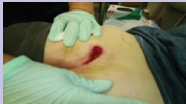
Figure 3. 5 July, presentation at clinic