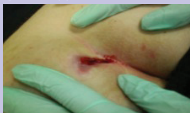
Figure 5. Wound at 22 July