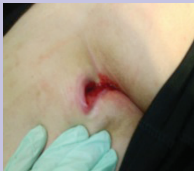
Figure 4. Wound at 8 July