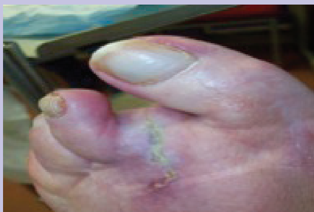
Figure 7. Wound on 1 June