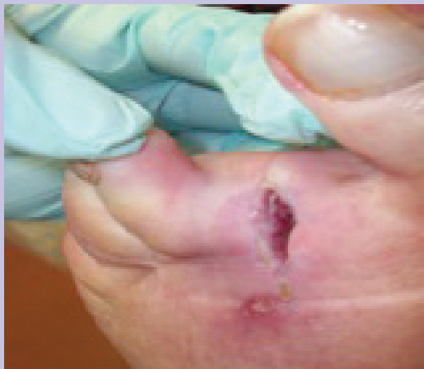
Figure 6. Patient presented with wound on 1 May