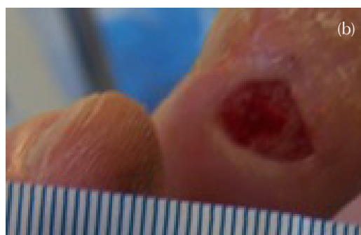
Figure 2a. Wound assessment (26/03/2015). b. Wound assessment (23/04/2015).

The wound was inspected on alternate days where debridement was undertaken as necessary and the dressing reapplied. After 4 weeks, the wound size had reduced to 8 mm x 8 mm x 1 mm deep, the wound bed was 100% granulation tissue and the exudate level was minimal (Figure 2b).